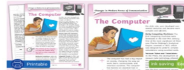
Changes in Modern Forms of Communication: The