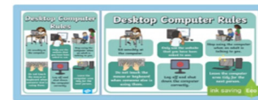
KS1 Desktop Computer Rules Poster