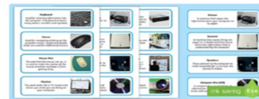
Parts of a Computer Labels

Please do enquire about this at the Principal if you are interested to do the computer class.