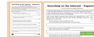
Searching the Internet: Animal Keywords Worksheet